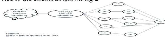
Fig 2 – Service supply chain for an online data backup service

Master service provider (Amazon) provides storage service to slave service provider. The slave service provider in turn splits the resource and distributes to multiple intermediates. The intermediates/value added resellers (VA) deliver the service to the clients as shown fig 2